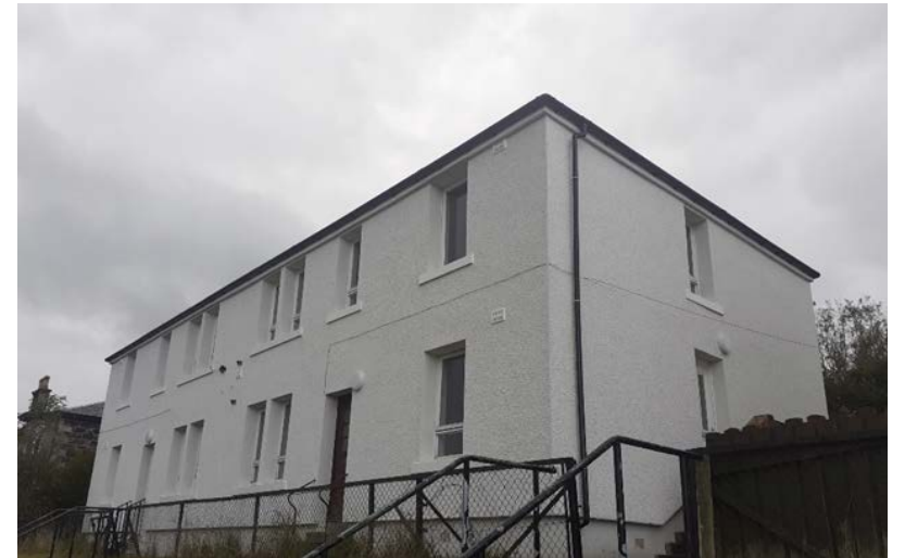
Longhill Terrace, Rothesay