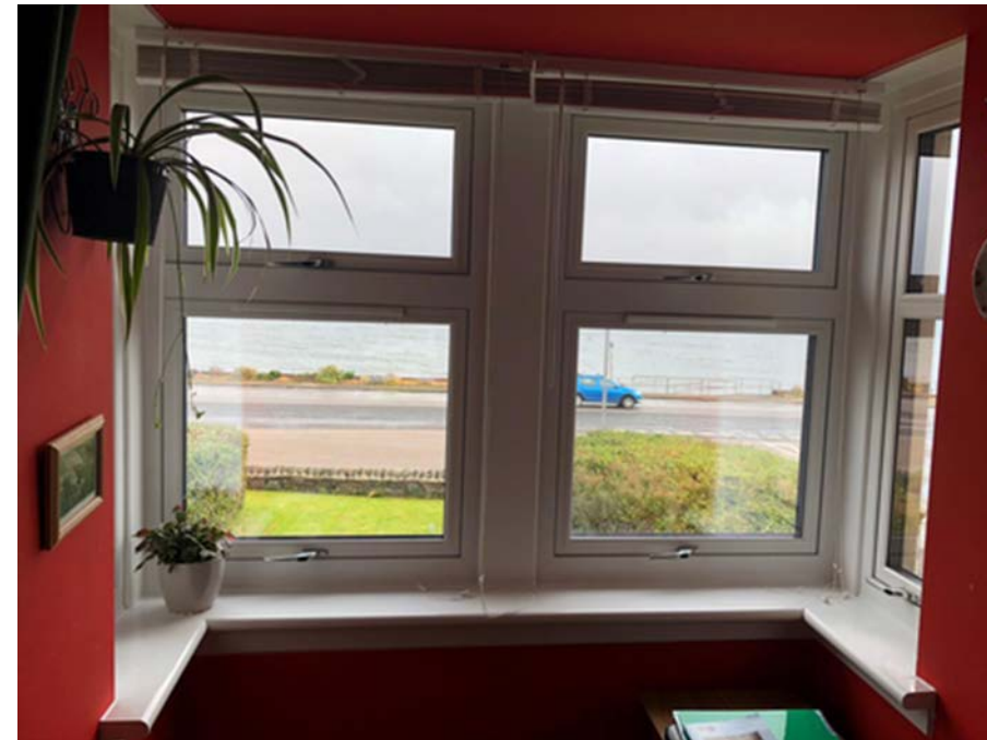
Before and after window replacement at Cragroy sheltered housing complex, Dunoon