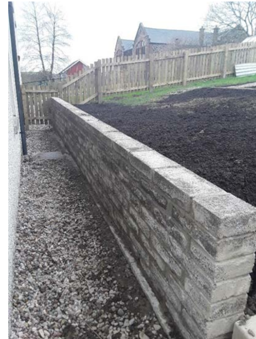
Exemplar estate work at Columshill, Rothesay