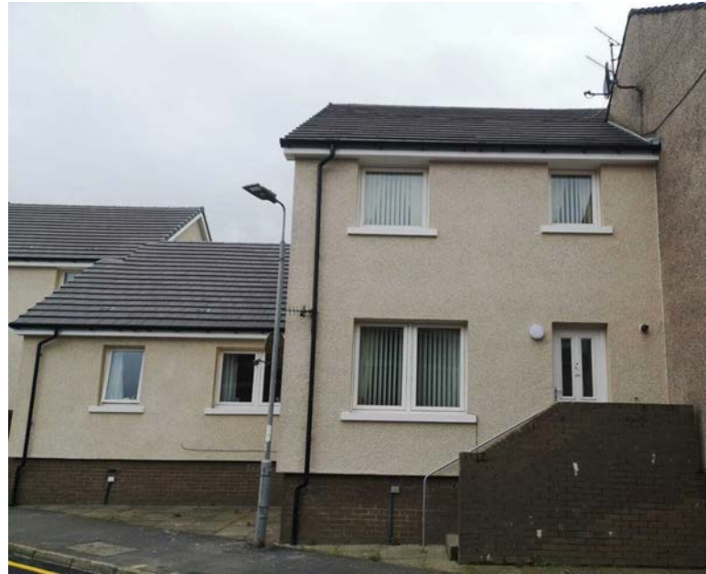
Ladeside Place, Rothesay