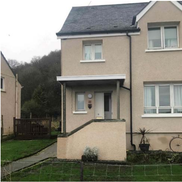
Cowal Terrace, Kames