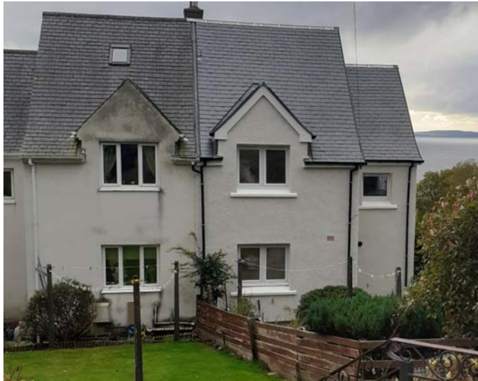
Braeside Terrace, Innellan