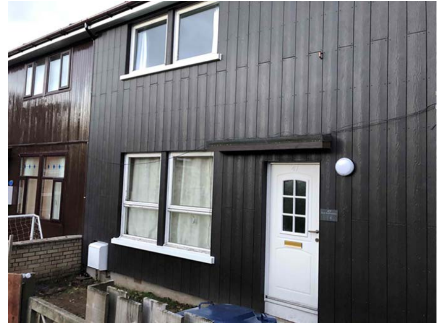
Eden Drive, Rothesay