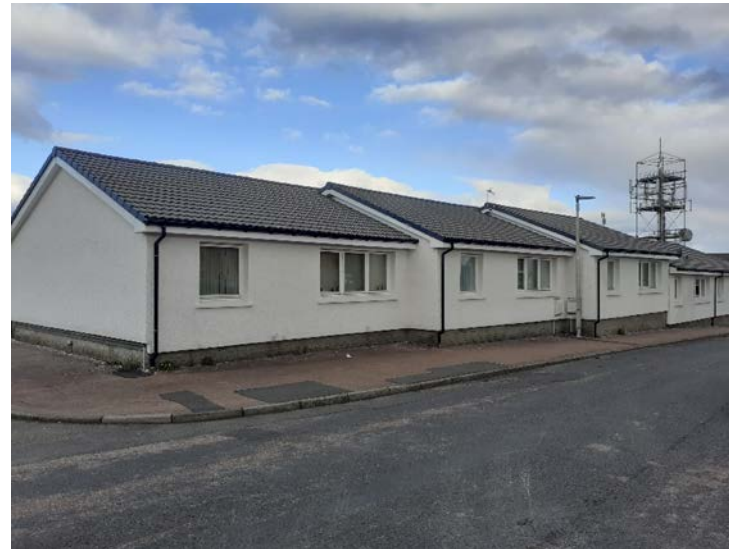
John Street, Dunoon